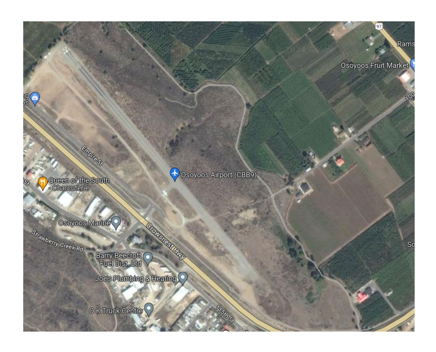
Site Flying area diagram A